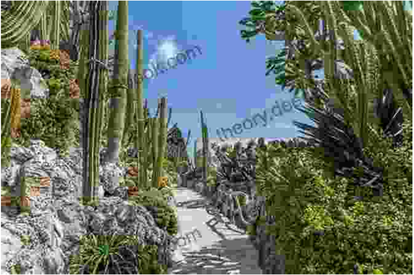
The Jardin Exotique