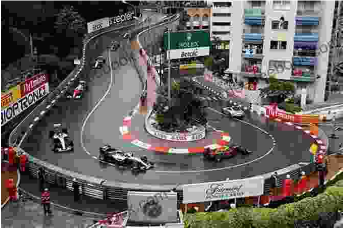
The Formula One Grand Prix