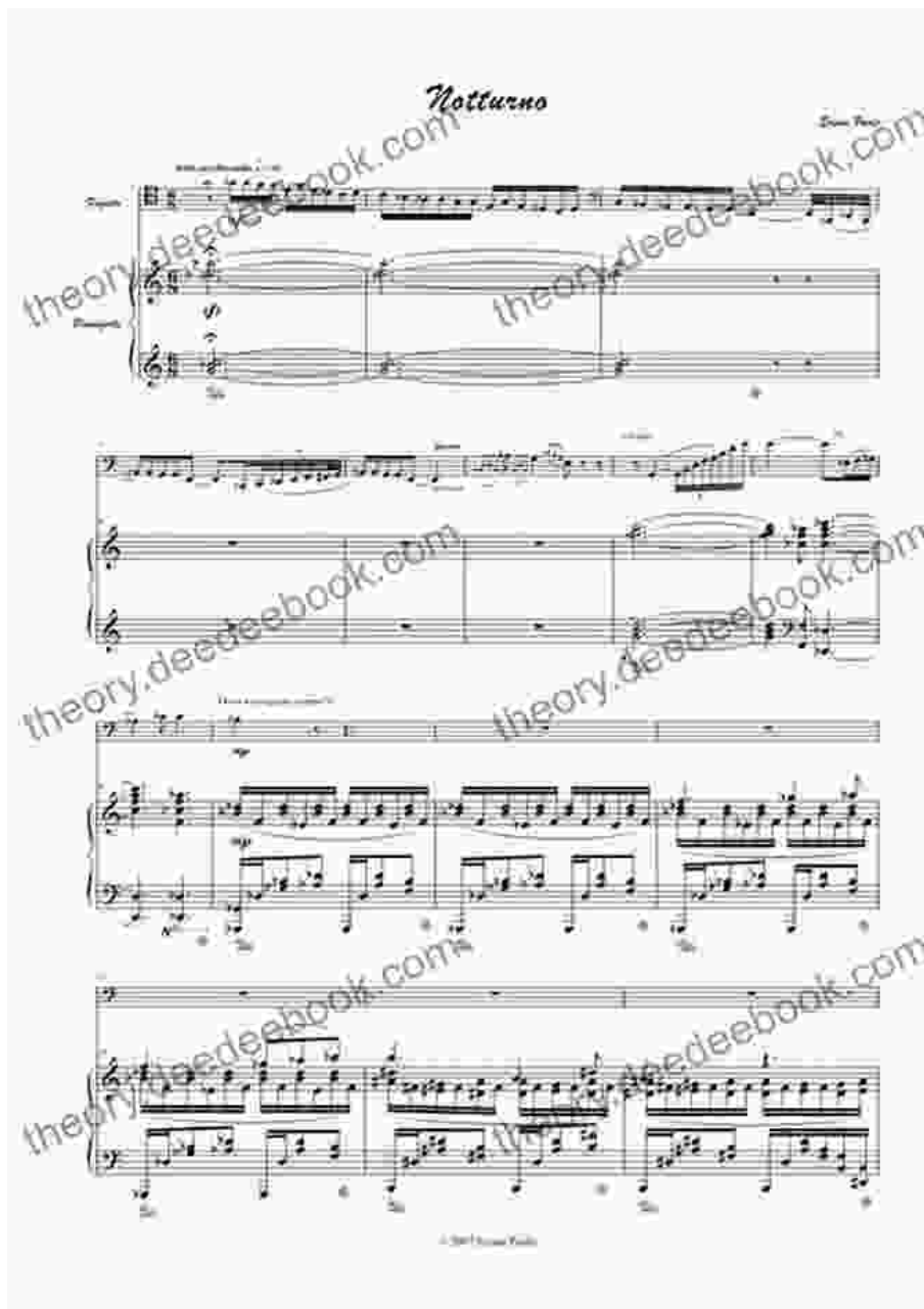
Notturmo from Bassoon Quartet in D major, Op. 41 by Friedrich August Kummer