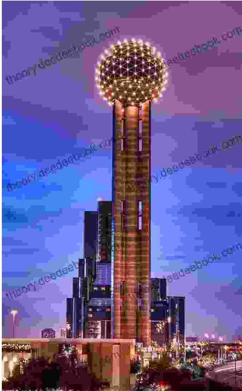
Dallas, a modern metropolis with a vibrant arts and culture scene