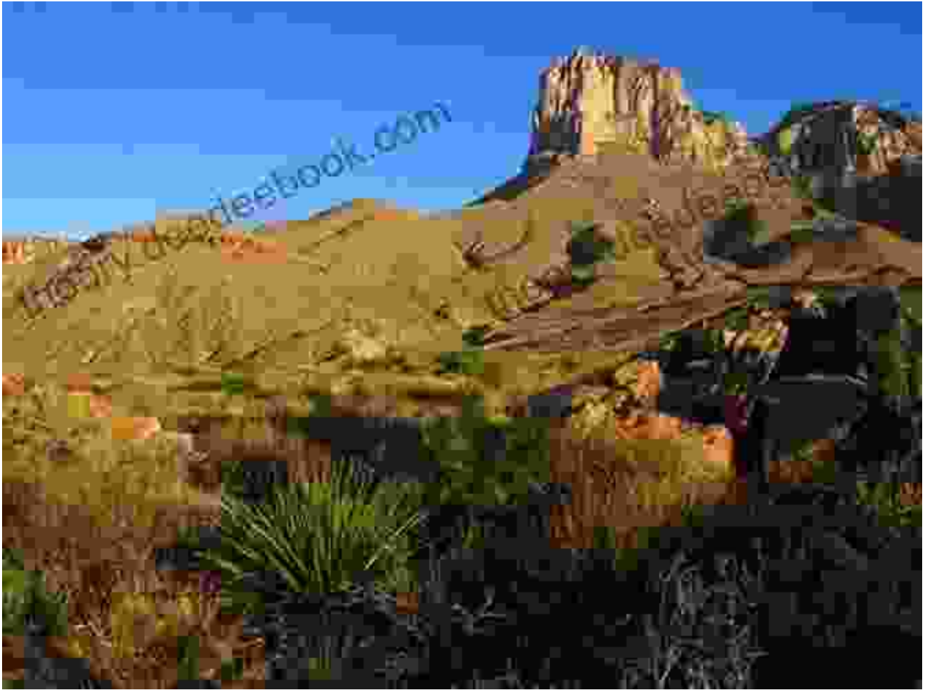
Guadalupe Mountains National Park, a breathtaking wilderness