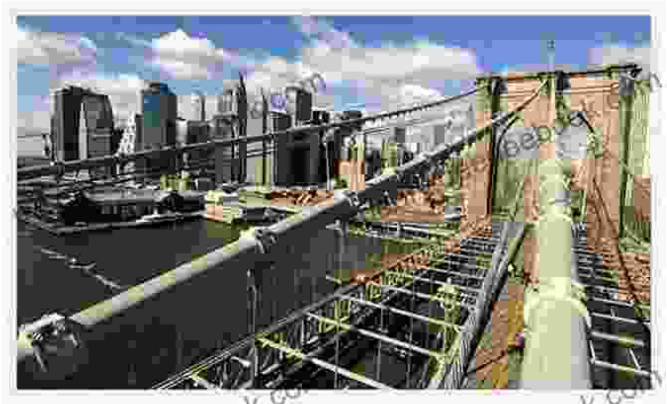
The Brooklyn Bridge

The Brooklyn Bridge is another iconic bridge that is located in New York City. The bridge spans the East River and connects the boroughs of Manhattan and Brooklyn. The bridge is a hybrid cable-stayed and suspension bridge and is one of the oldest bridges in the United States.