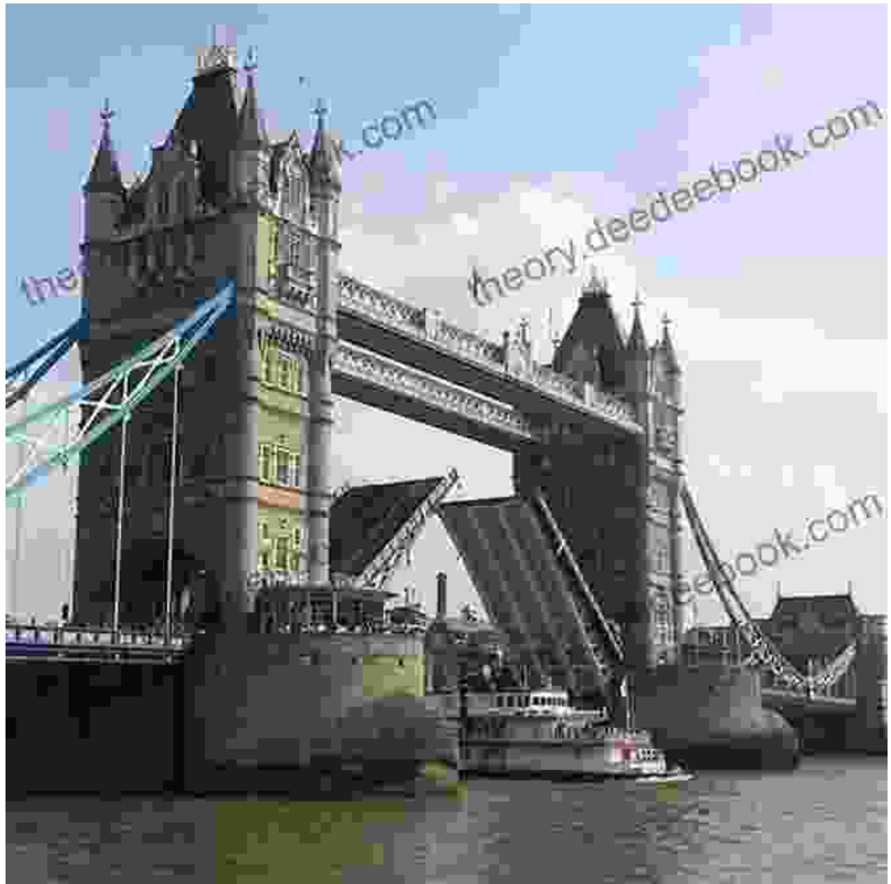
The Tower Bridge

The Tower Bridge was completed in 1894 and is one of the most iconic bridges in the world. The bridge is