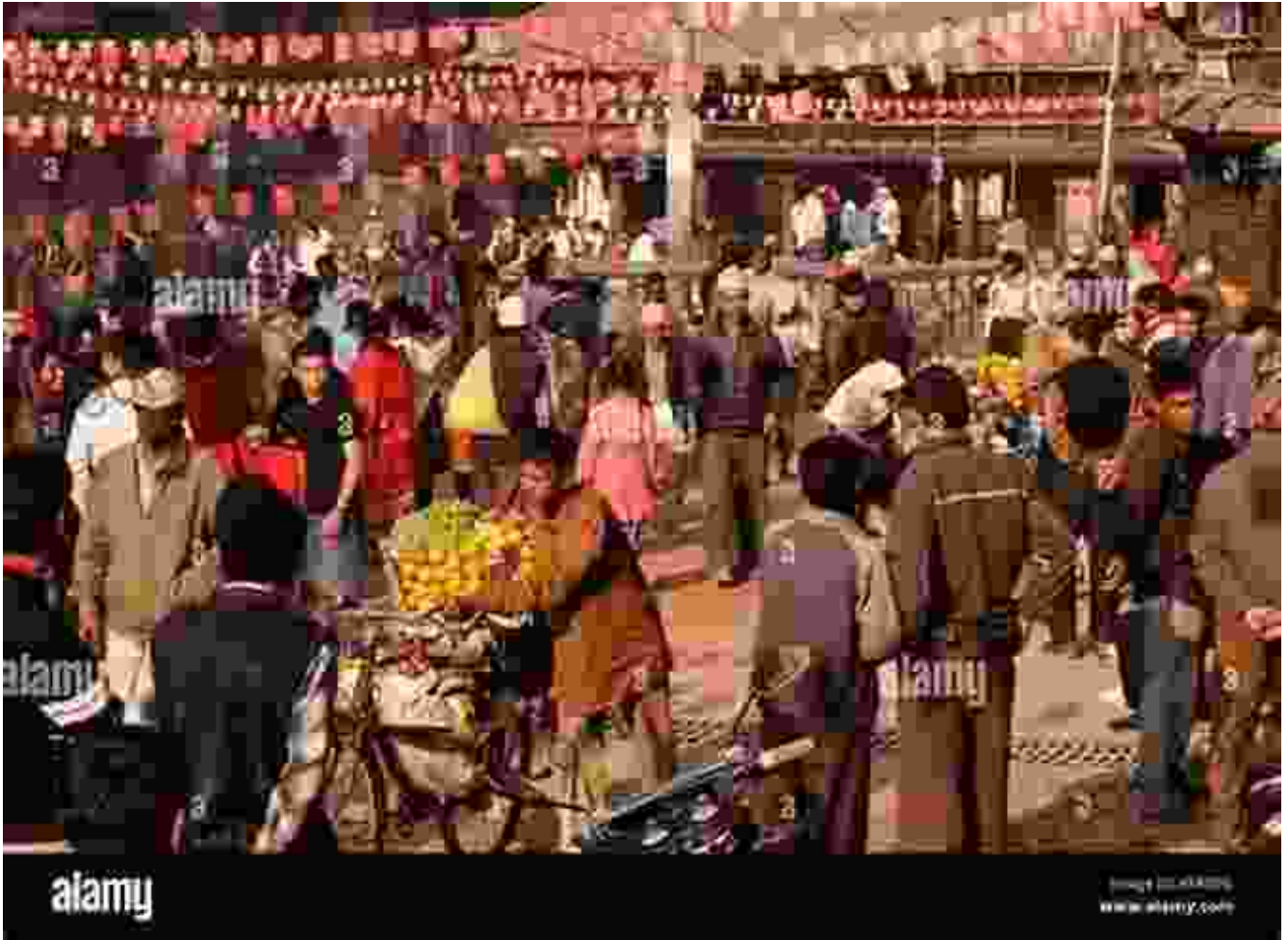
A lively and vibrant market scene in an Asian city.