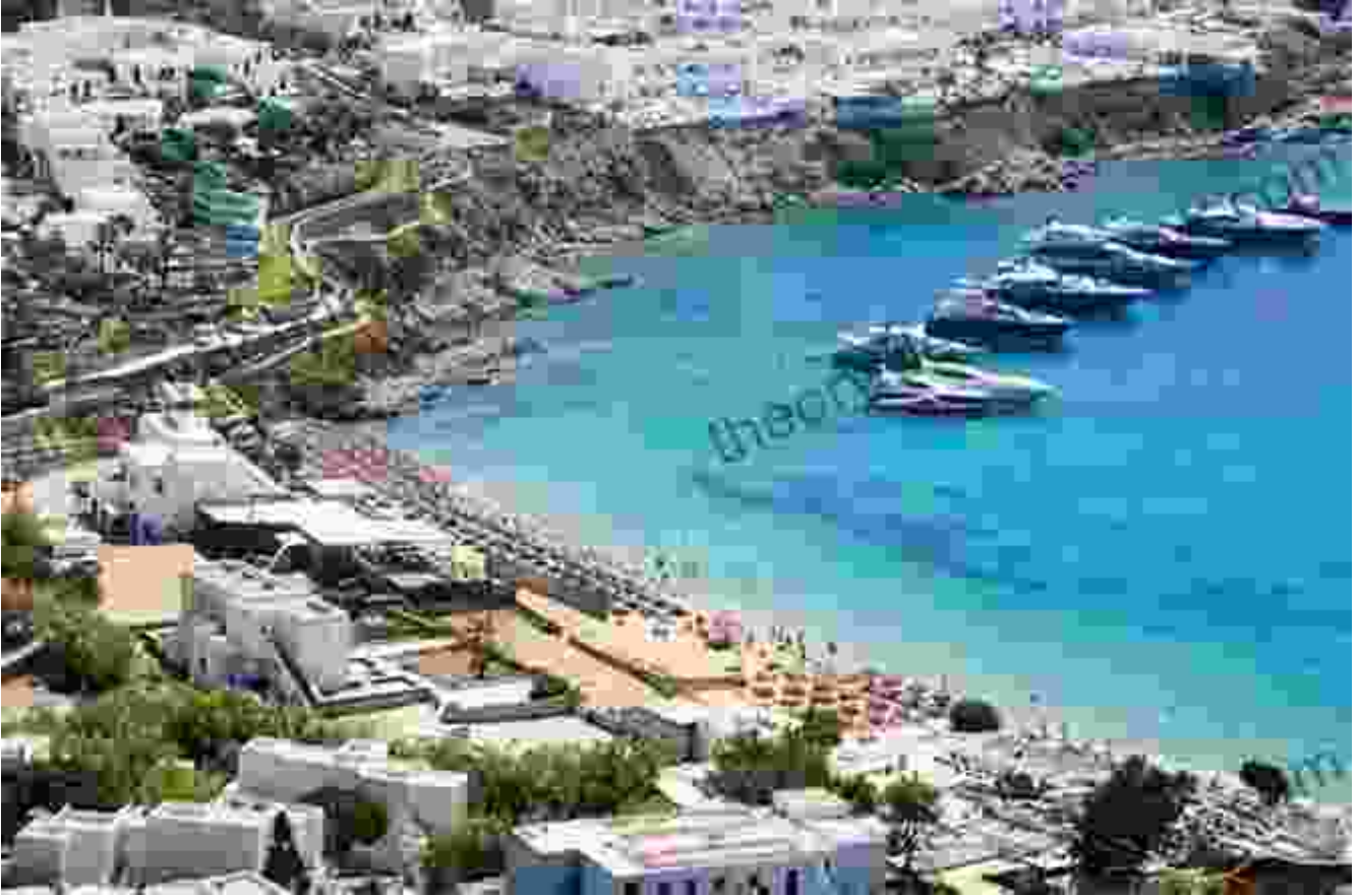
Mishi and Mashi on Psarou Beach in Mykonos