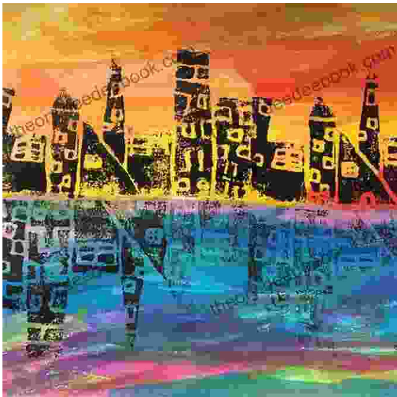
A chalk drawing of a city skyline on a sidewalk.