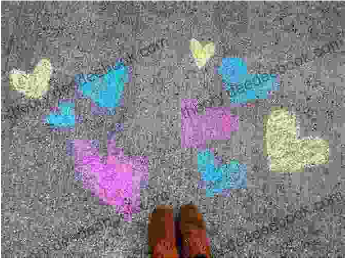
A love poem written in chalk on a sidewalk.