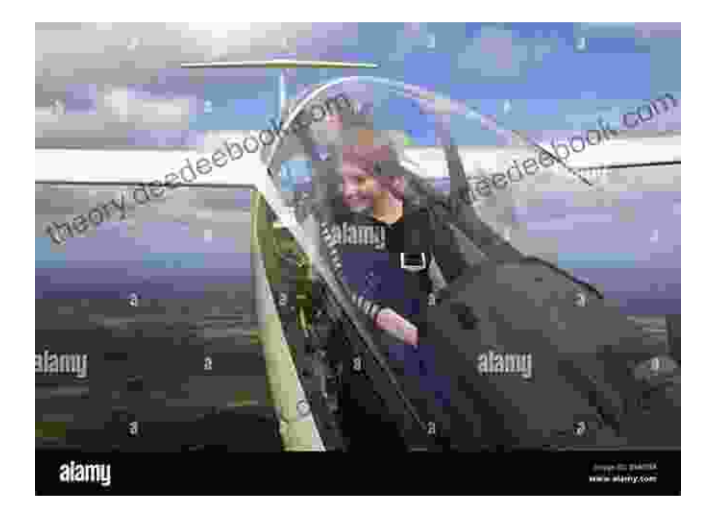
Taking to the skies with confidence

a symphony of exhilaration, driving them to push the boundaries of their abilities.